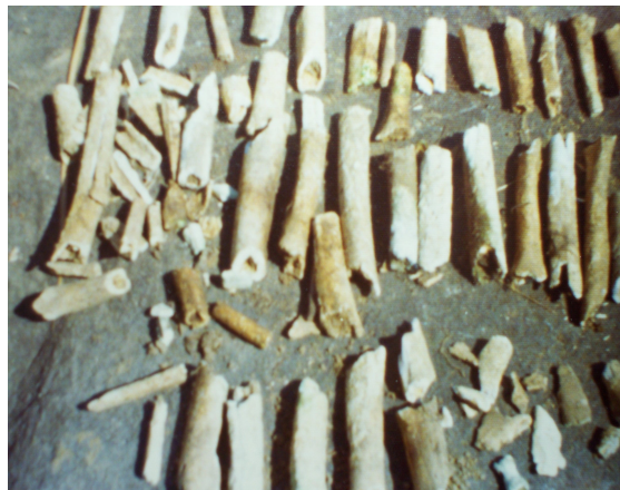
Bone fragments found scattered throughout the area for several hundred square feet.