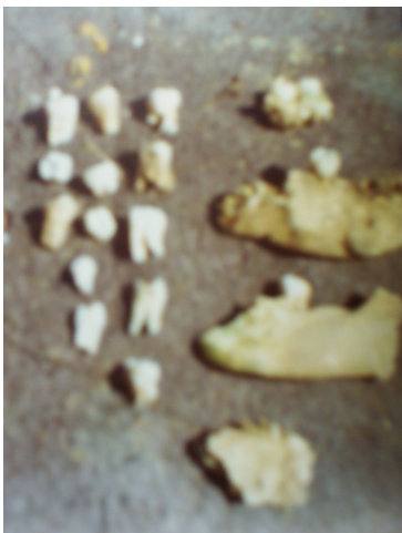
Skull fragments found from what is believed from one body. Could be an American or Filipino.....In any case we placed all the bone fragments in one container and buried them with dignity and a prayer.