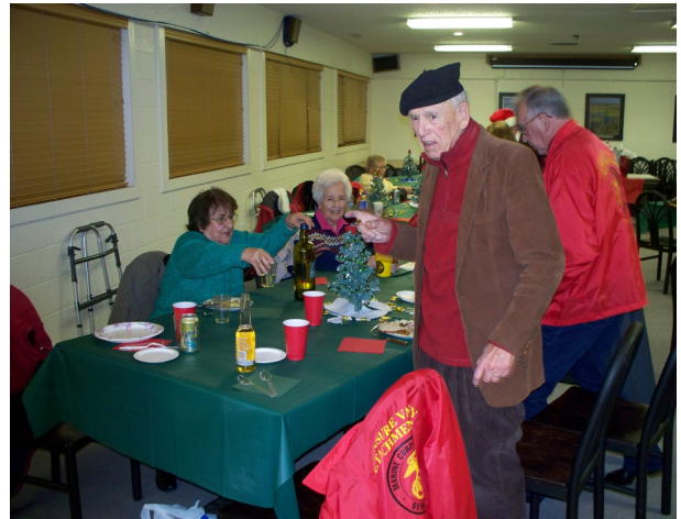
Where's the wine? I'm freezing, Honey