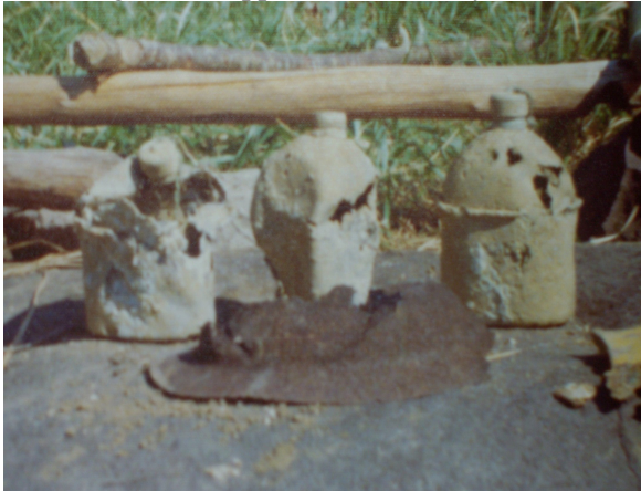
Notice the riddled fragment canteens. The canteens had a date of 1918

Today The cross standing on Mt Samat is a memorial to all those Americans and Filipinos who gave their lives for defending the Philippines and the way of life for the Filipinos.