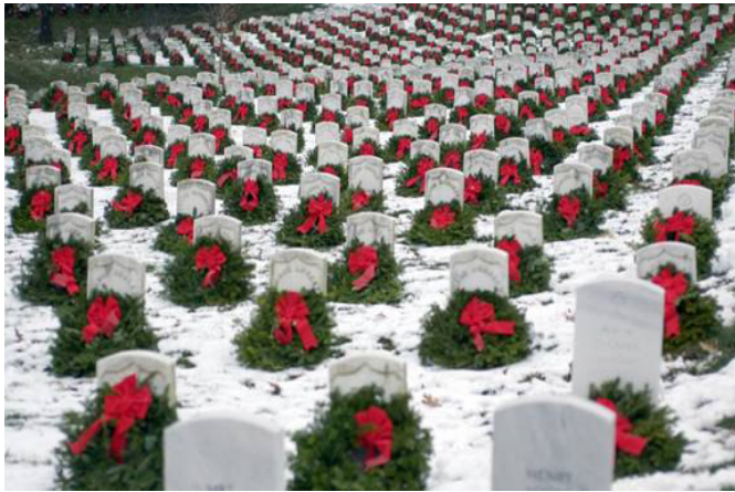
Christmas wreath laid out at Arlington National Cemetery